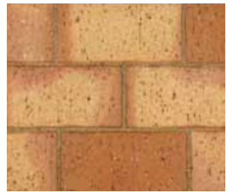
CEDERBERG PAVER PA (SABS 1575:2007) (ISO 9001:2008) 220 x 108.5 x 50mm/200 x 98.5 x 65mm (Chamfered and Nibbed). Available in special shapes and bullnose. Springs Factory – Gauteng