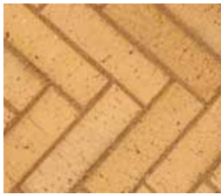
CHAMPAGNE PIAZZA PAVER PA 210 x 60 x 60mm (Chamfered) Springs Factory – Gauteng