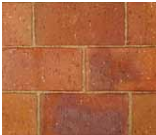
TUSCAN BLEND PAVER PA (SABS 1575:2007) (ISO 9001:2008) 220 x 108.5 x 50mm/200 x 98.5 x 65mm (Chamfered and Nibbed). Available in special shapes and bullnose. Springs Factory – Gauteng