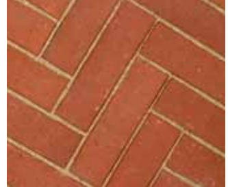
BURGUNDY PIAZZA PAVER PA 210 x 60 x 60mm (Chamfered) Springs Factory – Gauteng