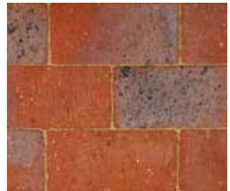
IRONSTONE PAVER PB 220 x 108.5 x 50mm (Nibbed) Springs Factory – Gauteng