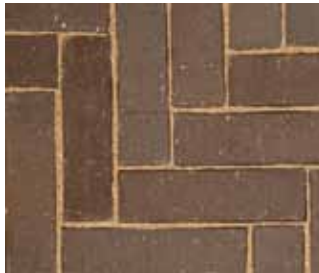
ONYX PIAZZA PAVER PA 210 x 60 x 60mm (Chamfered) Springs Factory – Gauteng