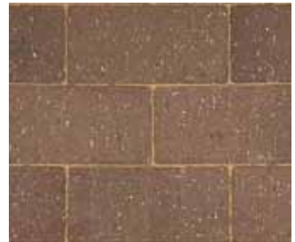
GRAPHITE PAVER PA 220 x 108.5 x 50mm/200 x 98.5 x 65mm (Chamfered and Nibbed). Springs Factory – Gauteng