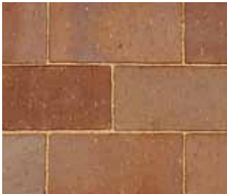
NUTMEG PAVER PA (SABS 1575:2007) (ISO 9001:2008) 220 x 108.5 x 50mm/200 x 98.5 x 65mm (Chamfered and Nibbed). Available in special shapes and bullnose. Springs Factory – Gauteng