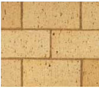
CHAMPAGNE PAVER PA (SABS 1575:2007) (ISO 9001:2008) 220 x 108.5 x 50mm/200 x 98.5 x 65mm (Chamfered and Nibbed). Available in special shapes and bullnose. Springs Factory – Gauteng