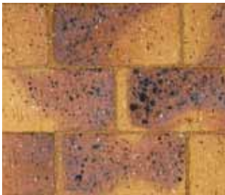
NAMAQUASTONE PAVER PB 220 x 108.5 x 50mm (Nibbed) Springs Factory – Gauteng