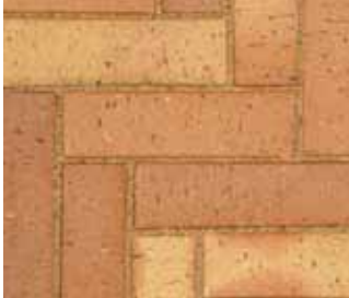
CEDERBERG PIAZZA PAVER PA 210 x 60 x 60mm (Chamfered) Springs Factory – Gauteng