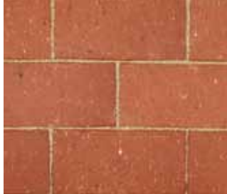
BURGUNDY PAVER PA (SABS 1575:2007) (ISO 9001:2008) 220 x 108.5 x 50mm/200 x 98.5 x 65mm (Chamfered and Nibbed). Available in special shapes and bullnose. Springs Factory – Gauteng