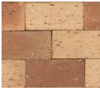
DUNE PAVER PB 200 x 98.5 x 50mm / 200 x 98.5 x 65mm Available in special shapes Phesantekraal Factory – Western Cape