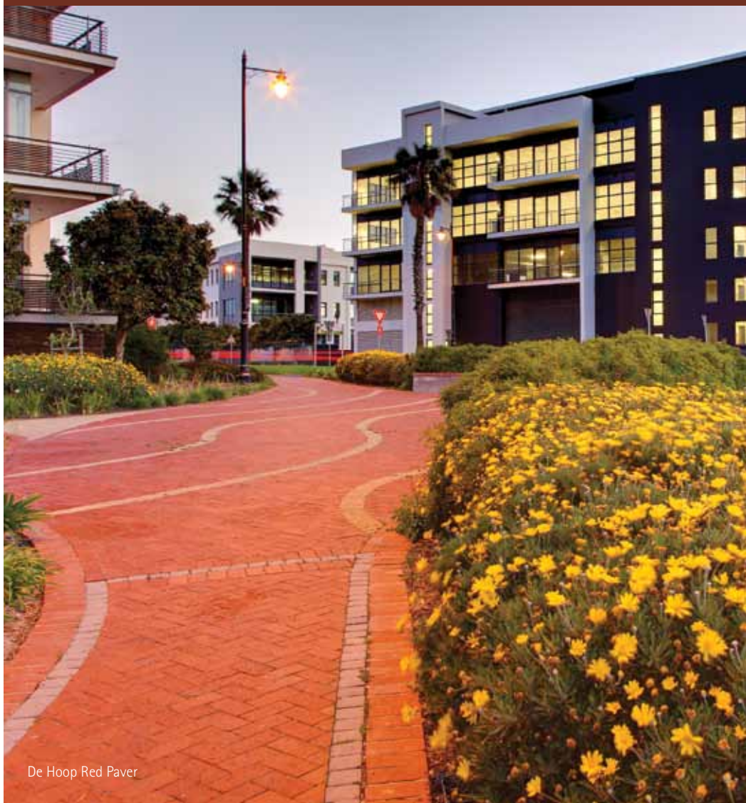
De Hoop Red Paver